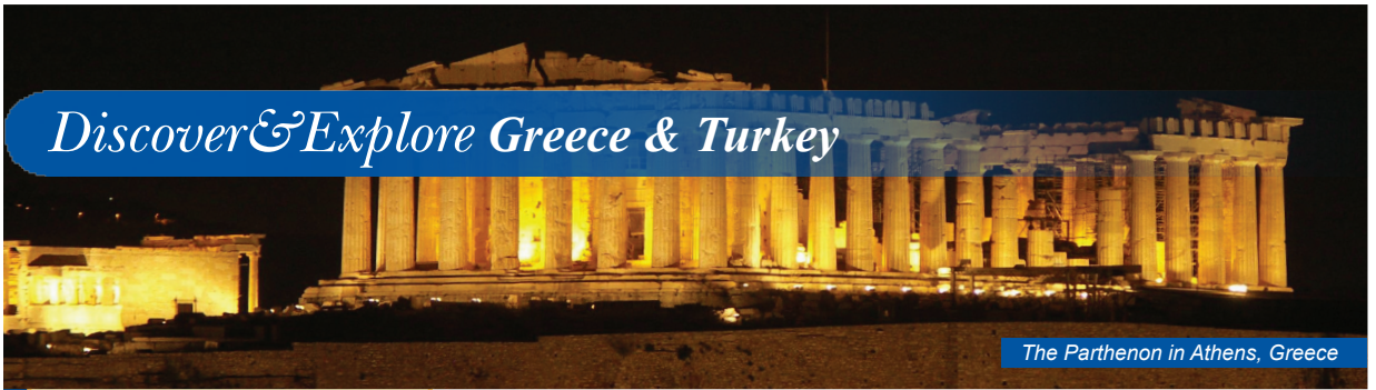
The Parthenon in Athens, Greece